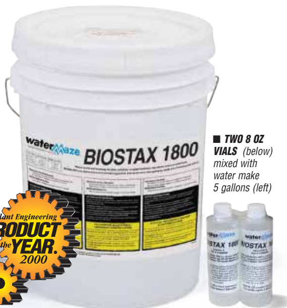
■ TWO 8 OZ VIALS (below) mixed with water make 5 gallons (left)

Important: BioStax 1800 must be kept refrigerated prior to use.