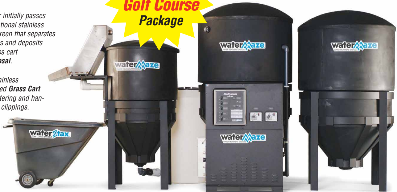
Optional cart for easy disposal of grass clippings

The CLB BioSystem is available with a WaterStax Golf Course package for treating wash-water with a high content of grass clippings and other greenery.