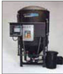
■ CL-600 Discharge System