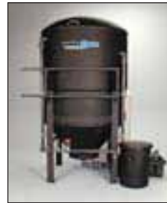
■ CL-30 Pre-Treatment Solids Separator