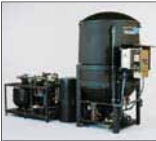
■ CL-603 with Filter Pac III Recycle System

Flow Rates of up to 30 GPM | Compact Footprint | Self-Contained Yet Modular Flexibility | Above Ground Design