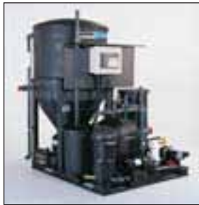
■ CL-304 Extra-Compact Recycle System