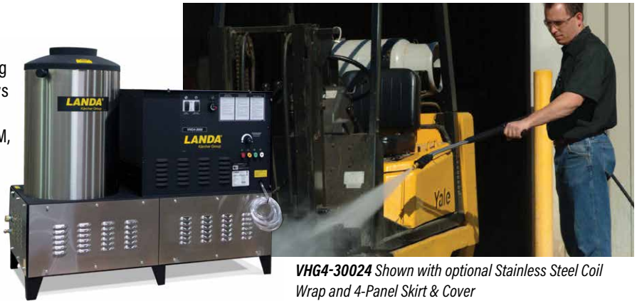
VHG4-30024 Shown with optional Stainless Steel Coil Wrap and 4-Panel Skirt & Cover

Compact but heavy duty, this natural gas model's footprint is a mere 24" x 53" for the smallest unit, making it an ideal choice for congested work areas or wash bays where space is at a premium. The small size makes it no less efficient; with cleaning power up to 3000 PSI and 8 GPM, this machine delivers enough cleaning action to tackle a variety of challenges, and includes an optional wireless remote control. The VHG is especially adept at cleaning and maintaining the appearance of the dirtiest fleet or construction equipment.