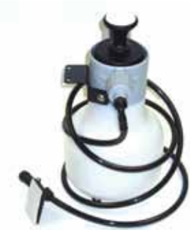
Optional Spray Kit

Cleans 7,500 sq. ft. per hour and 15,000 sq. ft. on one battery charge!