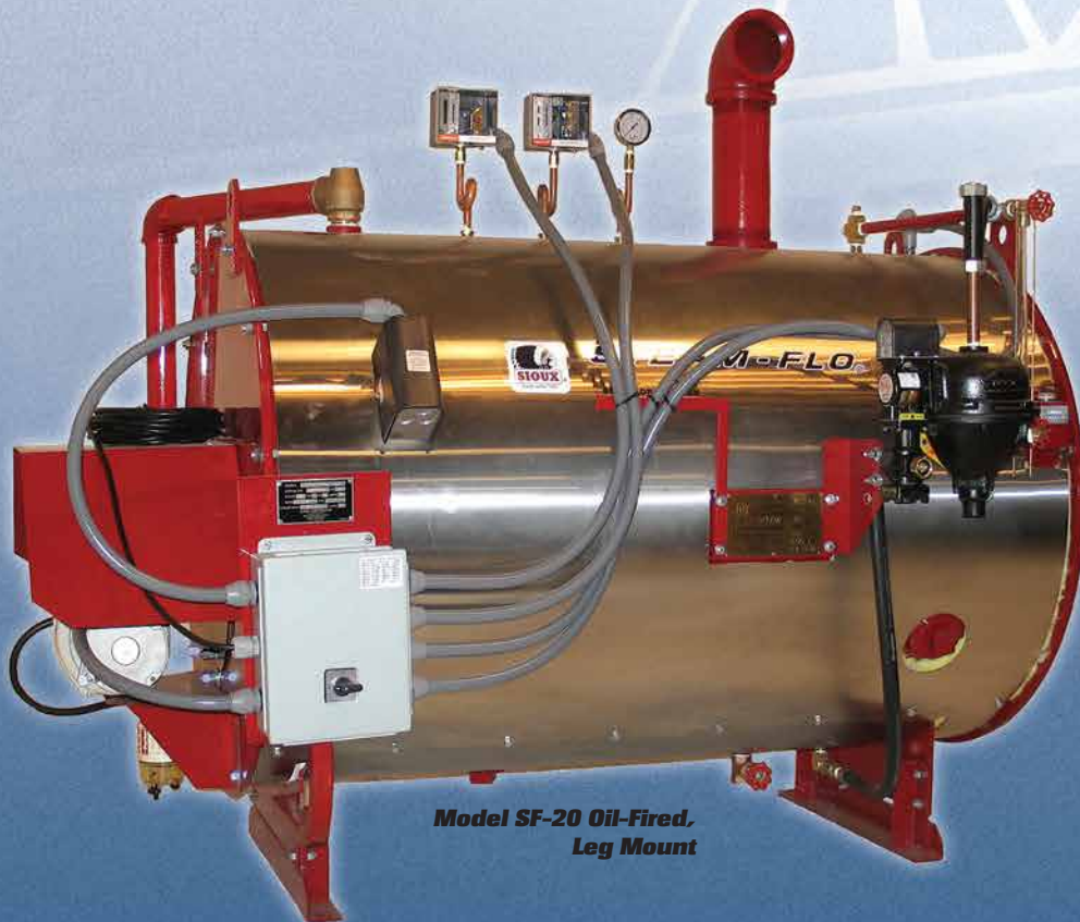
Model SF-20 Oil-Fired, Leg Mount