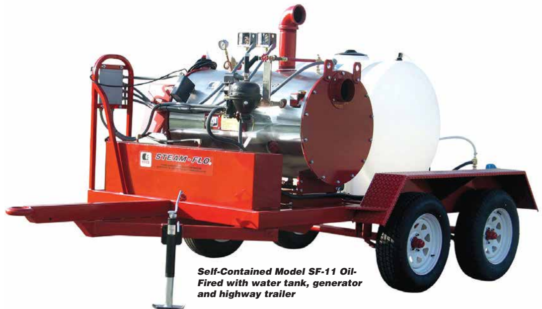
Self-Contained Model SF-11 Oil-Fired with water tank, generator and highway trailer