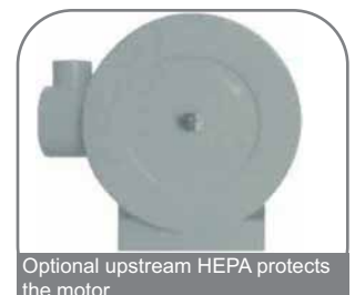
Optional upstream HEPA protects the motor