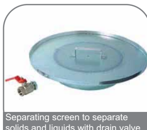
Separating screen to separate solids and liquids with drain valve