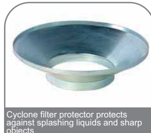
Cyclone filter protector protects against splashing liquids and sharp objects