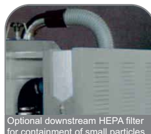
Optional downstream HEPA filter for containment of small particles