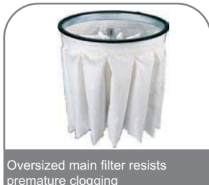
Oversized main filter resists premature clogging