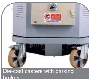
Die-cast casters with parking brakes