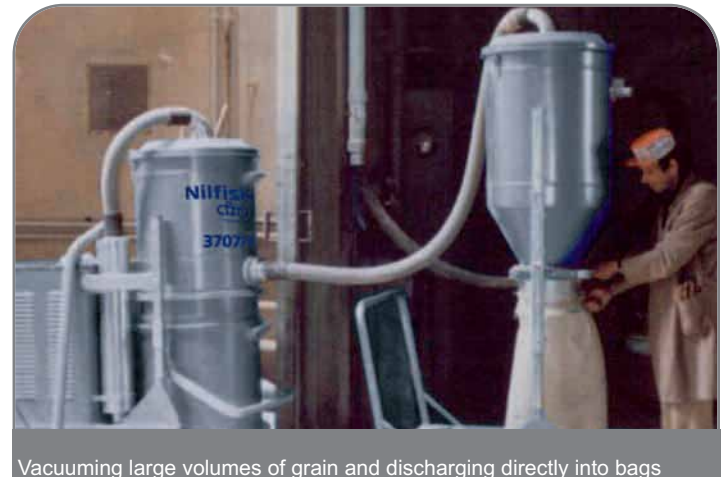
Vacuuming large volumes of grain and discharging directly into bags