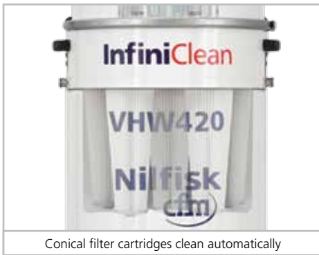
Conical filter cartridges clean automatically