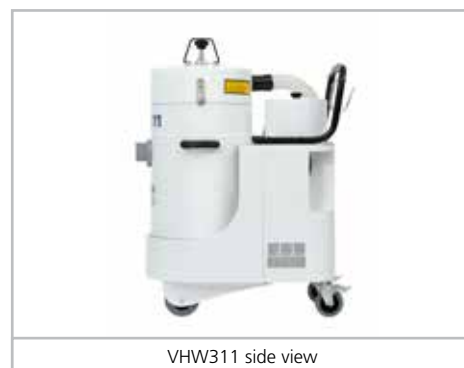
VHW311 side view