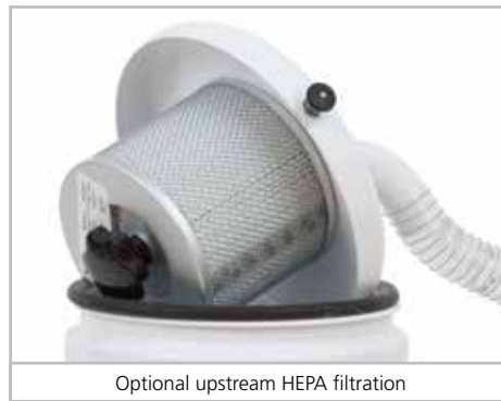
Optional upstream HEPA filtration