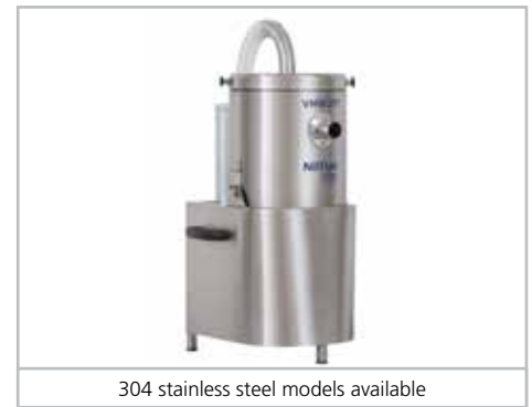
304 stainless steel models available