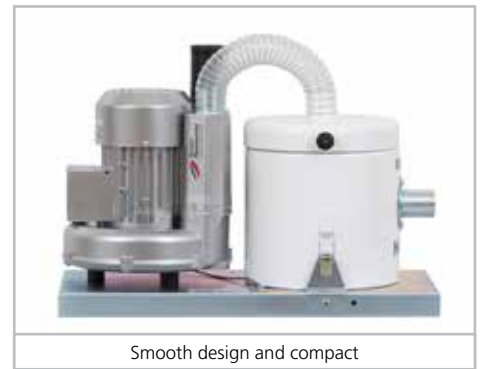
Smooth design and compact