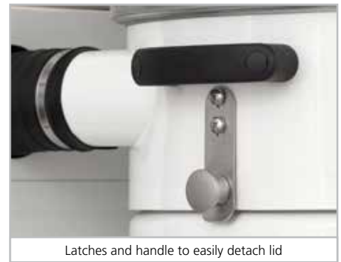
Latches and handle to easily detach lid