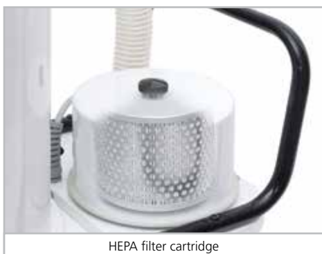
HEPA filter cartridge