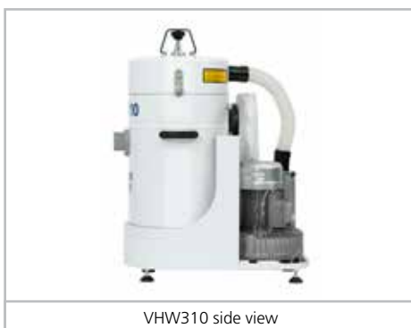
VHW310 side view