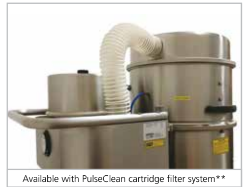
Available with PulseClean cartridge filter system**