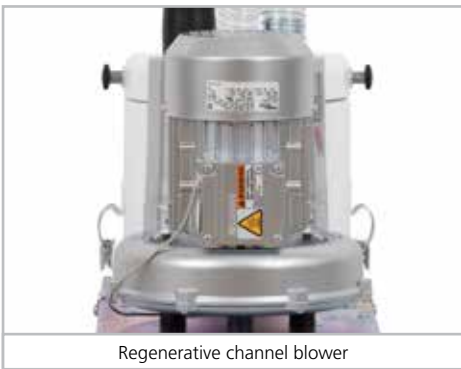
Regenerative channel blower