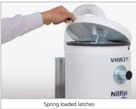
Spring loaded latches