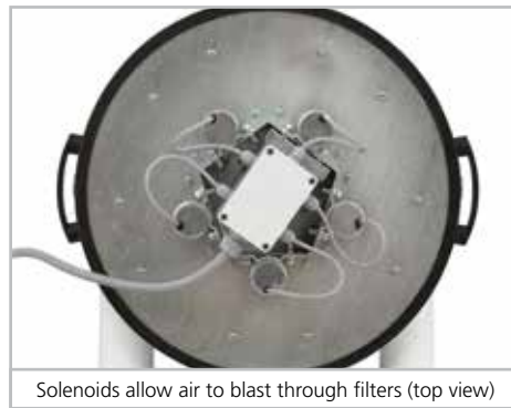
Solenoids allow air to blast through filters (top view)