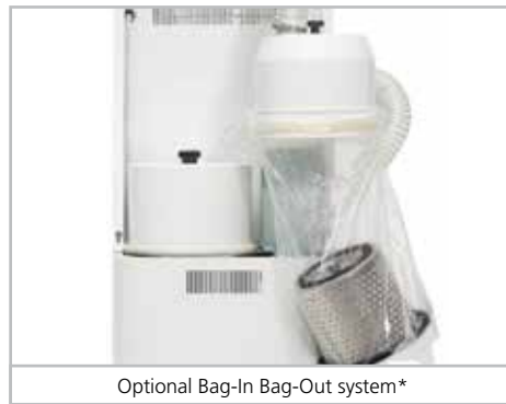
Optional Bag-In Bag-Out system*