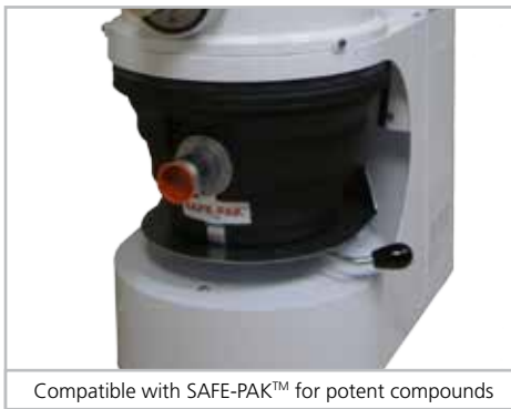
Compatible with SAFE-PAK™ for potent compounds