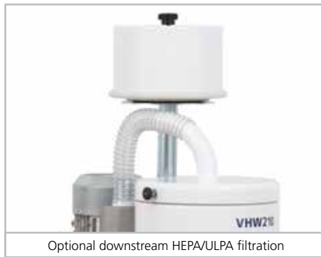
Optional downstream HEPA/ULPA filtration