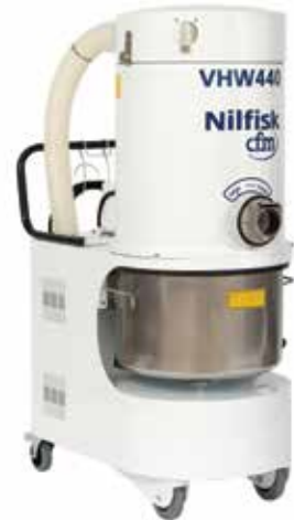
VHW420 / VHW440