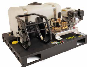
HD Direct Drive shown with optional HD Pallet Skid with Tank