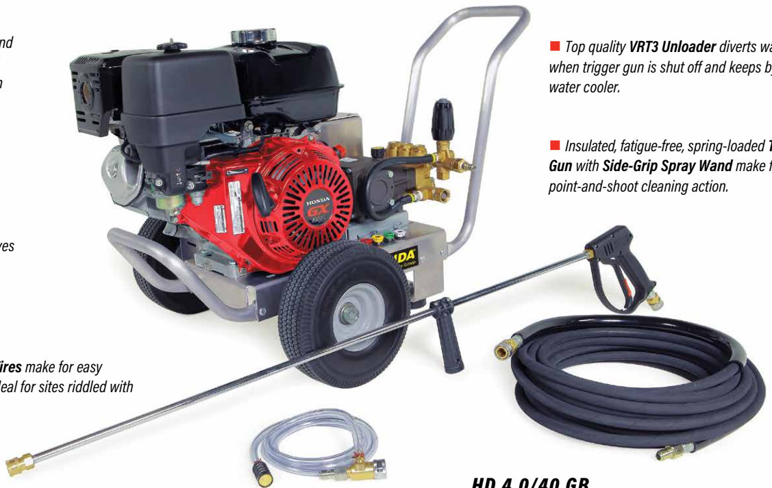
HD 4.0/40 GB

■ Puncture proof, Flat-Free Tires make for easy maneuvering on any terrain, ideal for sites riddled with nails and debris.