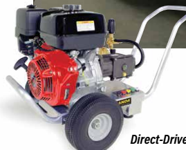
Direct-Drive HD Gas Cart