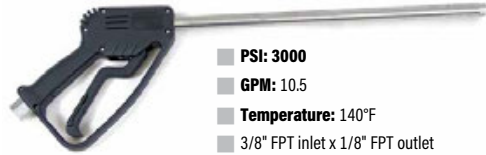
AP Single Barrel Dump Gun

Water continues to run through the tube even when trigger gun is closed.