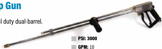
Dual Barrel Dump Gun