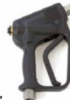
Model RL84 "Big Black Gun"