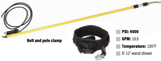
Belt and pole clamp

High-quality telescoping wand reaches up to 24', three sizes to choose from. Lightweight and balanced under pressure.