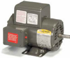
1 Phase 56 Frame