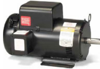
1 Phase 184T Frame