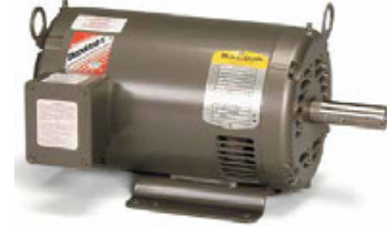
3 Phase 184T Frame