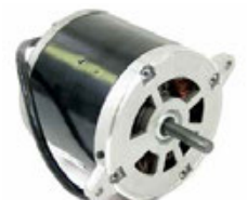
48M 5.75" Dia.