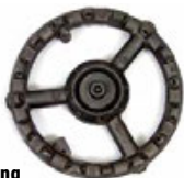
Gas Burner Ring

The standard for gas-fired pressure washers. Impinged jet burner rings offer the most efficient utilization of gas for heating water.