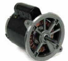
48N 7.25" Dia.