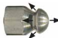
1-forward, 3 back ports