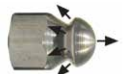
1-forward, 4 back ports