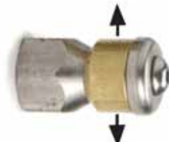
0-forward, 2 side ports