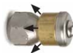
0-forward, 3 back ports

*Duct Cleaner jet to sides instead of reverse