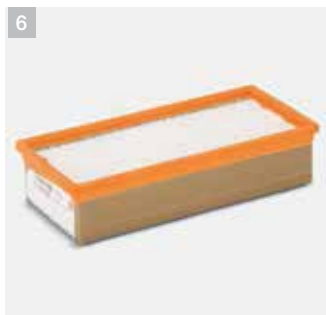
6 HEPA-level filtration