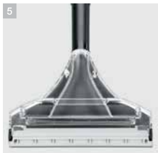
5 Flexible floor nozzle