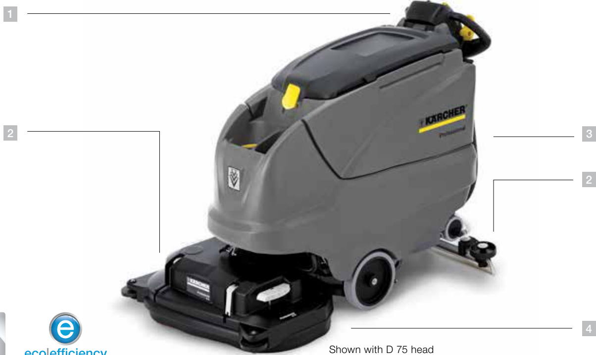
Shown with D 75 head

With a robust and maintenance-friendly brush head, the B 80 is available with roller or disc brushes in 22", 26" and 30" working widths. Equipped with KIK, a new 4-color display and automatic lowering and lifting of the cleaning head and squeegee, cleaning large areas is now easier.