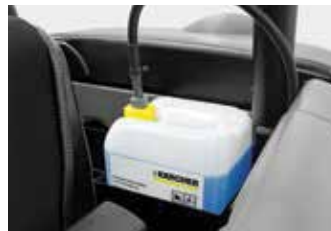
Cleaning agent dosing unit

For dark areas, such as in parking lots or in logistics areas, the work lights improve vision and make the machine easier to see.