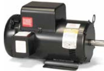
1 Phase 184T Frame