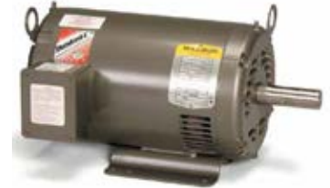
3 Phase 184T Frame