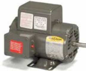
1 Phase 56 Frame