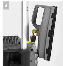
Shown with optional surface cleaner 2.111-016.0