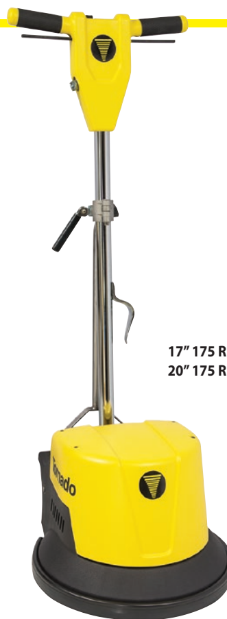
17" 175 RPM FLOOR MACHINE 20" 175 RPM FLOOR MACHINE

From daily polishing to heavy scrubbing or stripping, the Brute Force Series from Tornado® has what it takes for the cleaning and maintenance professional. These units will maximize cleaning efficiency, minimize equipment downtime and are offered at a price that runs circles around the competition.